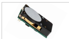
CozIR®-LP 2 Ultra-Low-Power CO 2 sensor