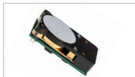
CozIR®-Blink Ultra-Low-Power CO 2 sensor with Power Cycling