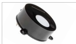
CozIR®-A with optional temperature and humidity sensing.